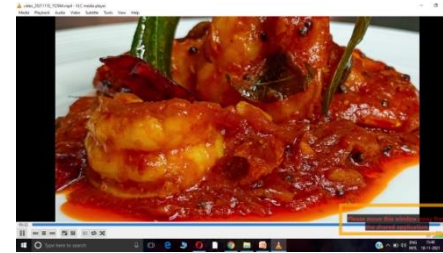
Final presentation of the dish